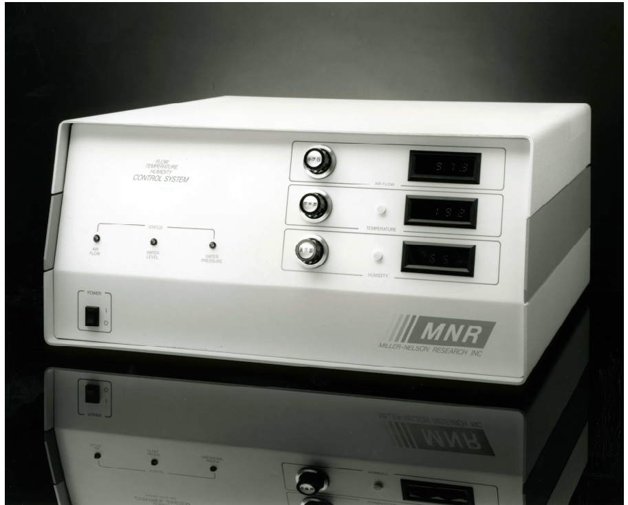
Model HCS-501 Series Flow-Temperature-Humidity Control System