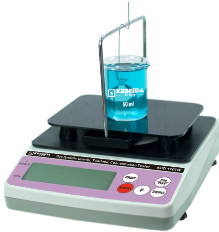
標準配件：玻璃砝碼組合 Standard accessory: Glass weight

Principle: The measurement of Twaddell( ^{\circ} TW) adopts the buoyancy method of Archimedean principle, after calculating by special software, it can show the liquid specific gravity S.G, heavy baume Be^{\circ} , twaddell ^{\circ} TW rapidly.