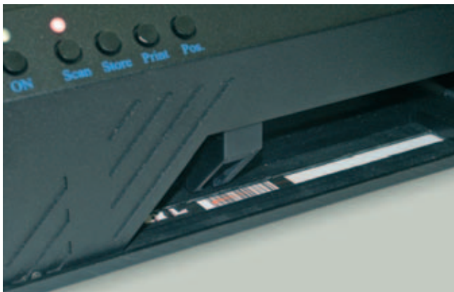
A measurement is carried out