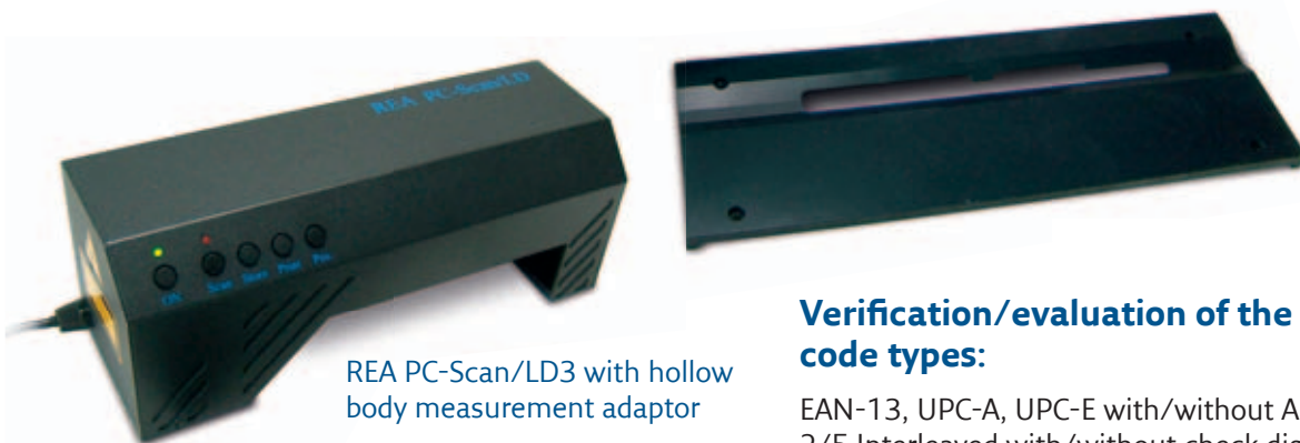
REA PC-Scan/LD3 with hollow body measurement adaptor

With the REA Verifier, you will find out why the read rates of codes are low. Optimize the quality of codes using the detailed measurement results.