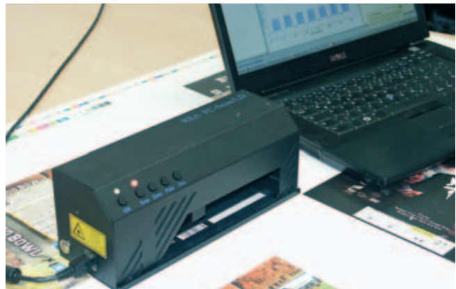
Measurement of printed sheets in production