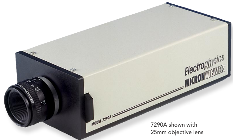
7290A shown with 25mm objective lens