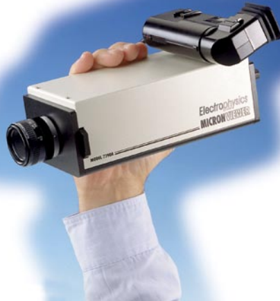
The 7290AX includes a rechargeable nickel-metal-hydride battery, viewfinder with diopter focus and adjustable handstrap.

The MicronViewer 7290A and 7290AX models combine many unique features and benefits in one versatile and affordable camera: broad spectral response (400nm to over 2 \mu m), excellent sensitivity and resolution, RS-170 60Hz or CCIR 50Hz video output, a variety of optional lenses and filters, and fixed-mount or handheld configurations, as well as extended-response versions!