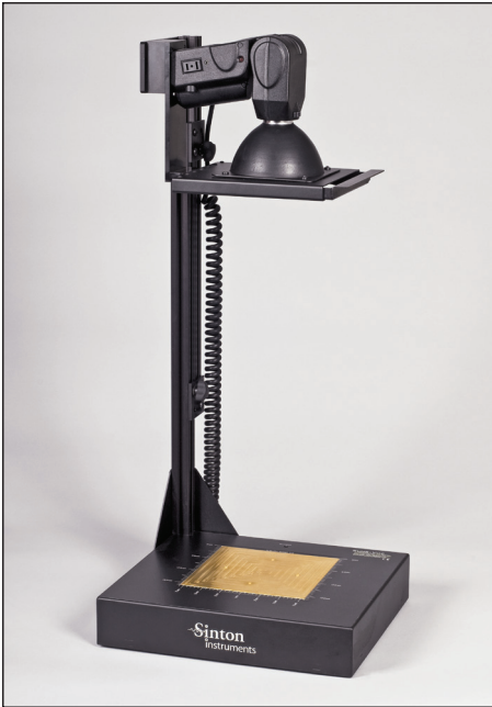
The Suns-Voc stage is available as an accessory to the WCT-120 lifetime testing instrument or as a stand-alone measurement system.

Perfect for paste-firing optimization and process control. Open-circuit method indicates the upper bound for any solar cell precursors after junction formation.