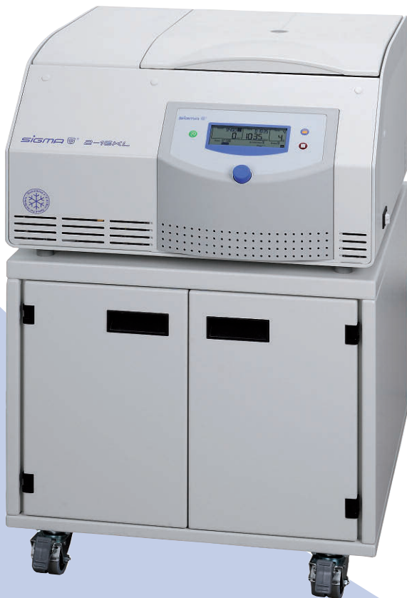
17920 Trolley for Sigma 2-16KL (w x d x h) (570 x 497 x 600 mm)