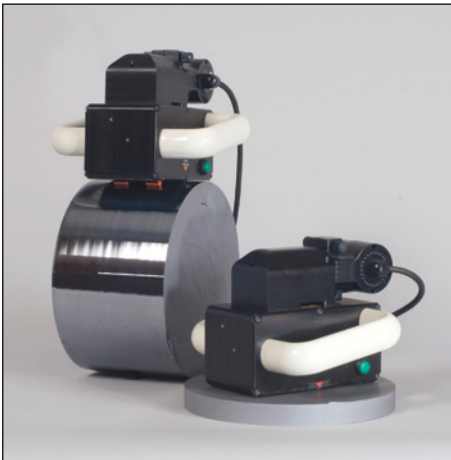
Shock absorbing, retracting pads that conform to ingot curvature enable the BLS-I to measure any surface of as-grown or shaped ingots.

Simple and accurate contactless measurement of true bulk lifetimes on as-grown or shaped silicon.