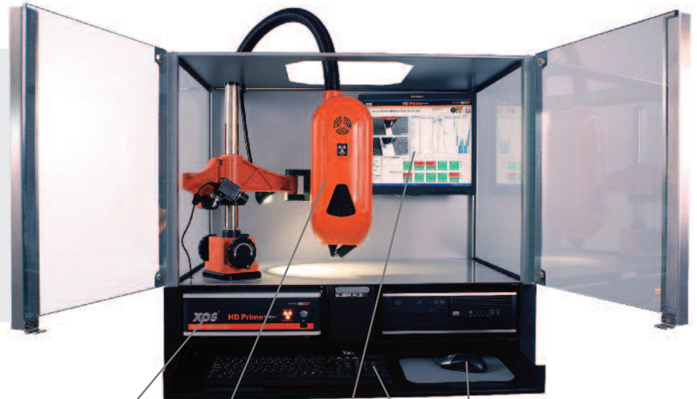
Control box and computer