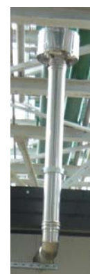
1019-ACC – Exhaust external pipe kit