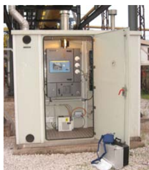
SG12WMTAS Shelter - Example