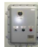
1001-ACC – Gas Detector 1095-ACC – Power Junction Box