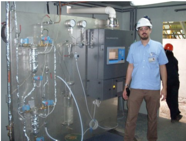
Commissioning in China (Skid Design)