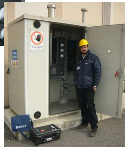
Maintenance in Italy (Shelter Design)

Specification ... Ask BAGGI ® measurement for your application, please contact info@baggi.com