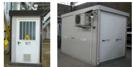
SG12WMTAS Shelter - Example

All components are pre-mounted and tested in factory. All components in contact with gas are in stainless steel series, teflon, zinc and neoprene.