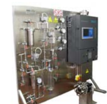
SG12WMTAK – Skid Design Example

All components are pre-mounted and tested in factory. All components in contact with gas are in stainless steel series, teflon, zinc and neoprene.