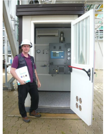
Maintenance in Italy (Shelter Design)