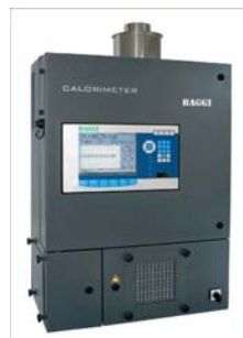
SG12WMTAU – Unit Basic Design Example

The thermal principle offer very high rangeability (40-100% typical and 10-100% as option) and the best performance also with has mixed where the composition is not stable and change during the process