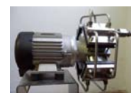
1013-ACC – Pump