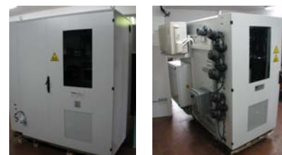
SG12WMTAC Cabinet Example

All components are pre-mounted and tested in factory. All components in contact with gas are in stainless steel series, teflon, zinc and neoprene.