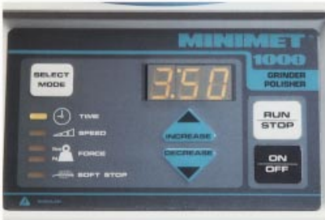
Face Panel features touch-pad controls and LED displays of all grinding/polishing parameters.