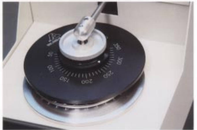
Precision Thinning Attachment enables SEM and TEM samples to be prepared.