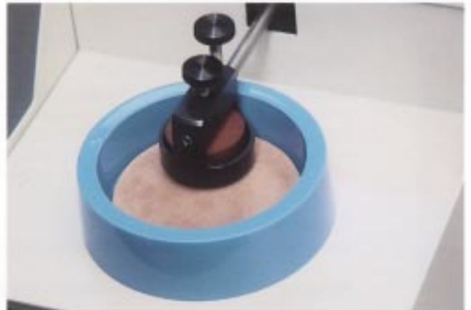
Caged Sample Holder facilitates sample preparation without the need to drill a back hole in the sample.