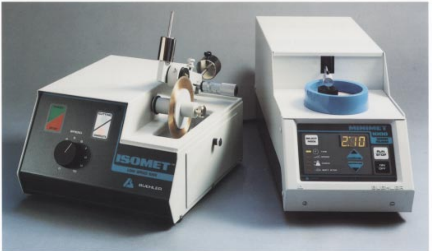
The ISOMET® Low Speed Saw is an excellent companion to the MINIMET 1000 Grinder/Polisher including when low deformation sectioning is required prior to polishing.