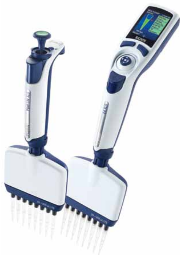
Pipet-Lite XLS+ and E4 XLS+ models

Speed plate work with Rainin's E4 XLS+ electronic multichannel pipettes. Special modes streamline how you transfer multiple aliquots, perform serial dilutions and pre-program series of volume transfers.