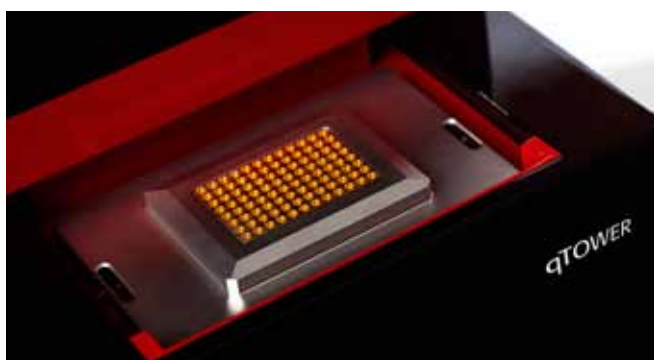
■ Integrated 96 well LPR thermal block for rapidPCR using qTOWER

Additionally Analytik Jena's SPS (Sample-Protection-Systems) ensures best protection of the samples inside the thermal block, by cooling down to 20 °C during heat up of the slided lid, prior to start of the PCR. Thereby the maximum set temperature of 120 °C and the automatic, high contact pressure ensure best sample recovery without any condensation, even in case of small reaction volumes.