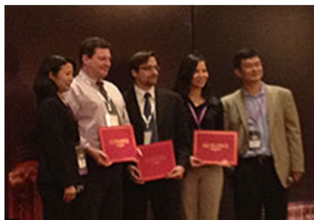
2012 Innovator Award recipients