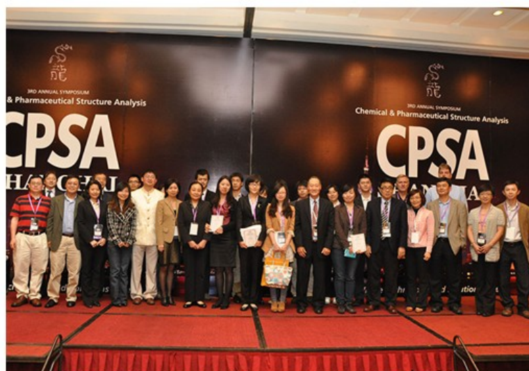
2012 Young Scientist Excellence Award recipients

For more information of the CPSA Shanghai 2013 event, please visit: http://www.cpsa-shanghai.com .