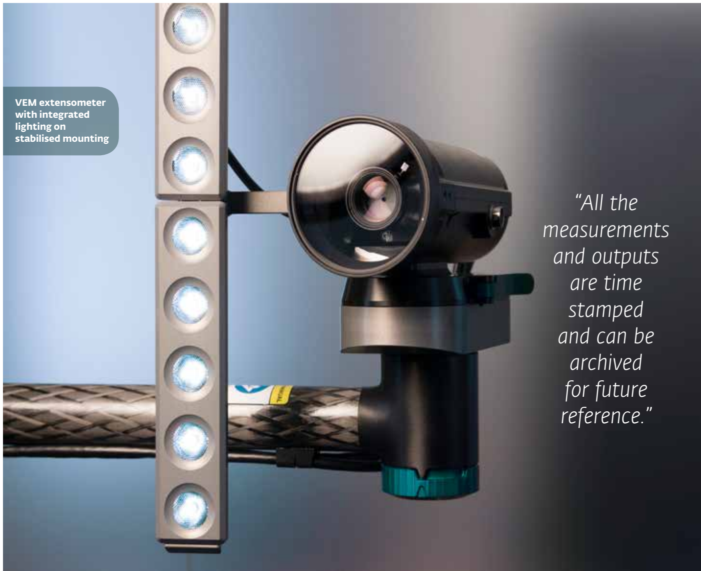
VEM extensometer with integrated lighting on stabilised mounting

"All the measurements and outputs are time stamped and can be archived for future reference."